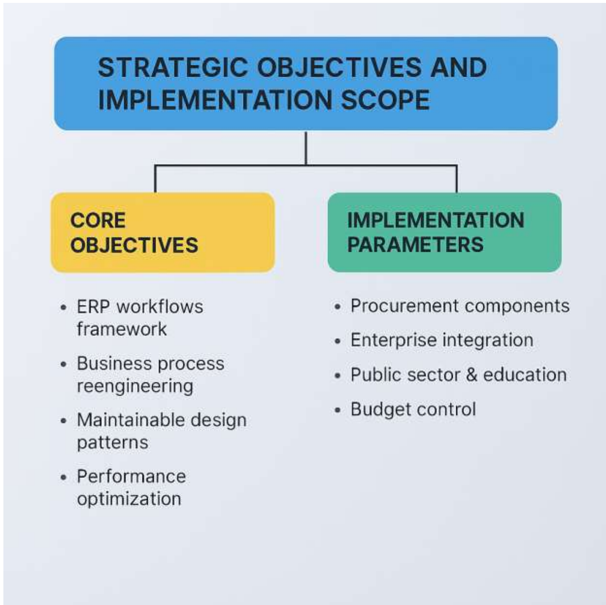
Fig 2: Strategic Objectives and Implementation Scope [7, 8]

enforcing sponsor requirements through configurable business rules. Their implementation maturity model demonstrates how general ledger integration provides essential financial visibility, enabling comprehensive financial analysis through standardized transaction coding and reporting structures. The research concludes that institutions achieving the highest implementation maturity leverage these integration points to create a cohesive control environment that balances compliance requirements with operational efficiency [7].