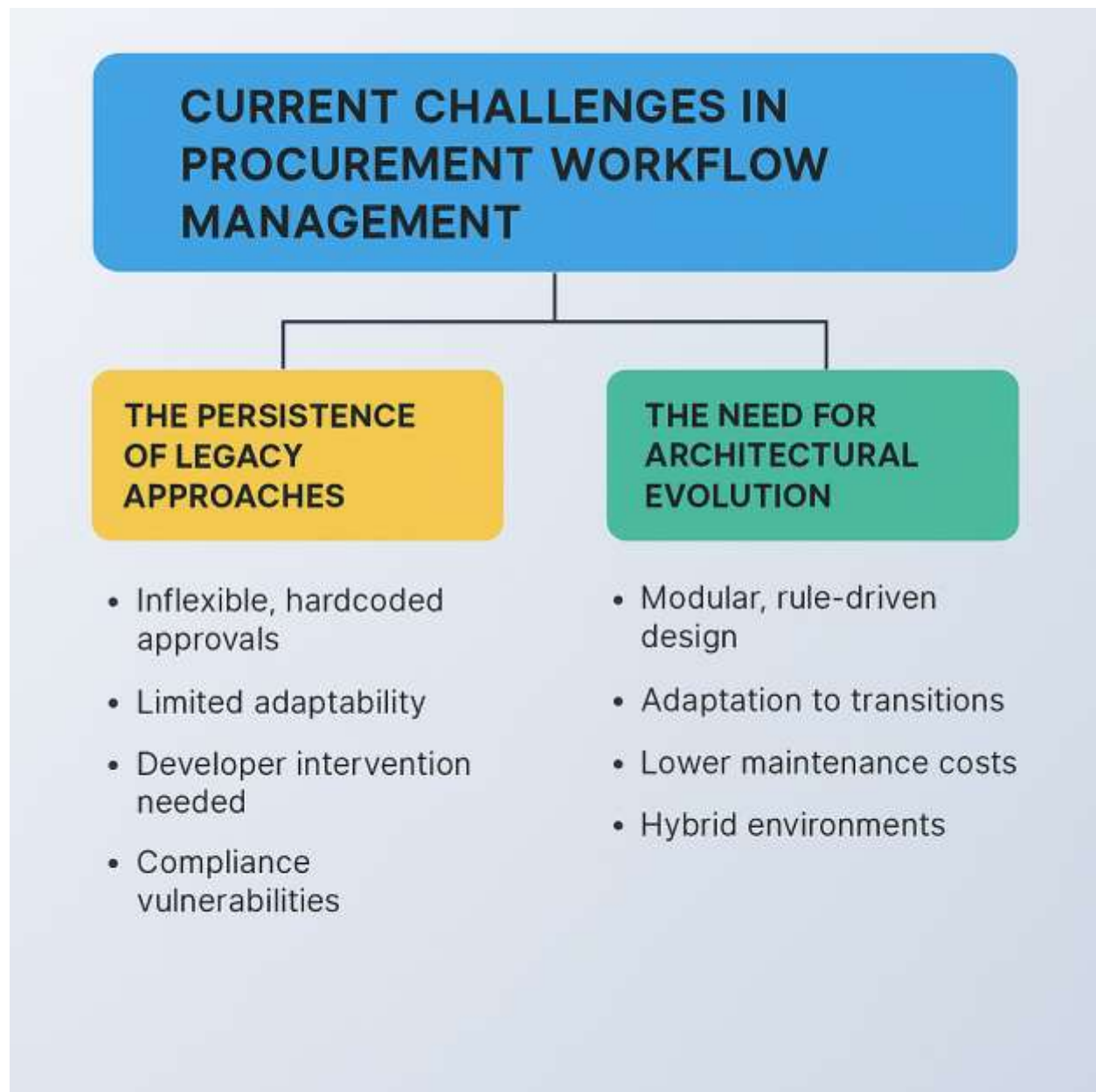
Fig 1: Current Challenges in Procurement Workflow Management [3, 4]