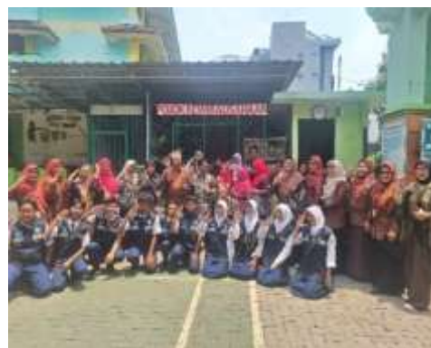
Figure 12. Students practice the entrepreneurship in the Entrepreneurship Corner during a visit from PKK Penajam Paser Utara