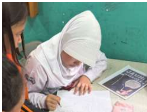
Figure 7. Students of SDN Lagoa 07 North Jakarta created a poster on preventing negative

In order to prevent moral degradation, schools create an SLP Task Force consisting of representatives of students, educators, and parents. The SLP Task Force has the task of socializing, reporting, and following up on various negative behaviors such as bullying, intolerance, sexual violence, and others. As part of the implementation and dissemination of SLP, students in groups create prevention video content and upload it to social media such as TikTok or Instagram.