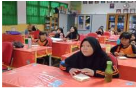
Figure 5. Implementing Pancasila Values through the MBG Program at Lagoa 07 Elementary School

Students also practice cooking vegetables and omelets made from Moringa in the Healthy Lifestyle Corner. The SLP is also supportive implementation Pancasila values through the Free Nutritious Meal Program (MBG) include: praying together before eating, queuing orderly, mutual cooperation on duty room eating, washing tool Eat alone, and education nutrition and management rubbish.