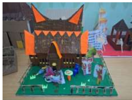
Figure 10. Miniature of Traditional Indonesian Houserom Non-Organic Waste Processing made by Students