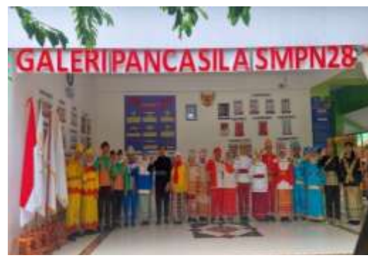
Figure 4. SMPN 28 Jakarta Students wearing Indonesian Traditional Cloth in the Pancasila Gallery