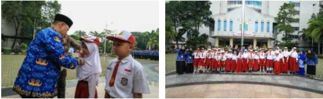
Figure 11. SLP Pinning at SDN Lagoa 07 North Jakarta by the Deputy Mayor of North Jakarta