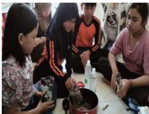
Figure 11. Students of SDN Lagoa 07 North Jakarta make pudding to sell at Market Day

The school collaborates with Bank DKI, Bank BCA, and Bank BNI to educate students to save diligently and be able to manage their finances from an early age. Students also practice entrepreneurship by making various products and selling them at the school's Entrepreneurship Corner and community. This collaboration encourages the growth of an entrepreneurial spirit and financial independence from school age.