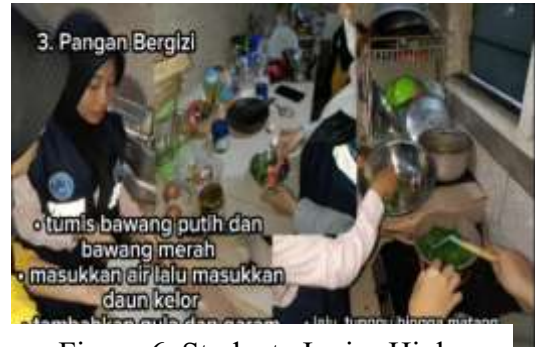
Figure 6. Students Junior High School 28 Jakarta practice to cook omelettes and moringa vegetables in the Healthy Lifestyle Corner