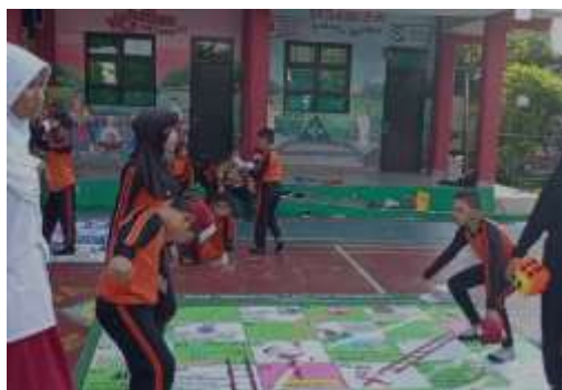
Figure 9. Students of SDN Lagoa 07 Play Snakes and Ladders. SLP Objective 4; Environmental