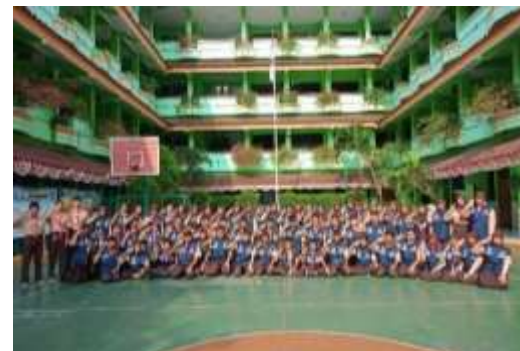
Figure 8. Task Force of SLP SMPN 28 Jakarta